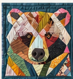
Stitch in the Ditch