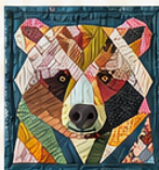
Straight Line Quilting